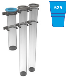
Wall Mounted 3 Tube Cups, Lids & Liquid