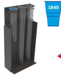
Free Standing 3 Tube Cups, Lids & Liquid