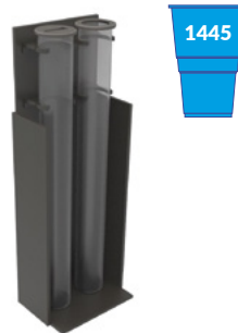
Free Standing 2 Tube Cups & Lids