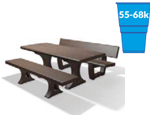
Tables & Benches